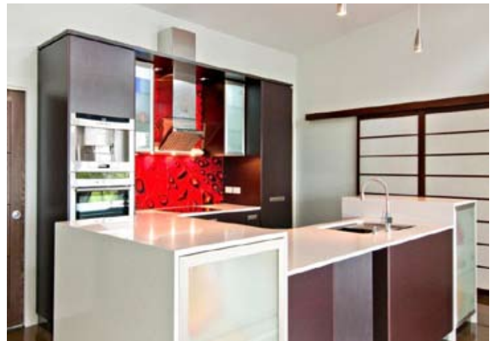
Toughened glass splashback