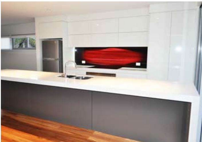
Toughened glass splashback