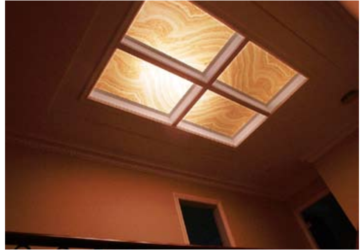
Glass backlit skylight panels