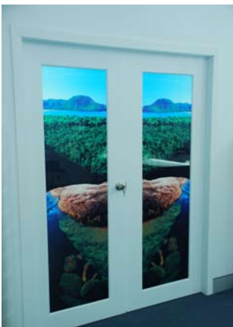
Glass door panels