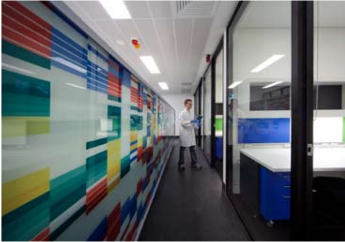
Glass dividing screen