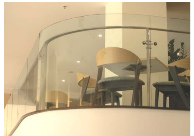
12 mm Clear toughened curved glass balustrade Parkview Hotel, Melbourne Victoria