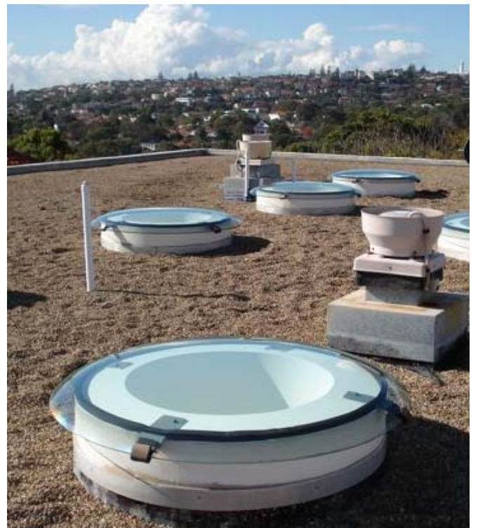
15.5mm clear laminated curved glass 1900mm diameter dome rooflights Private residence, Eastern Suburbs Sydney