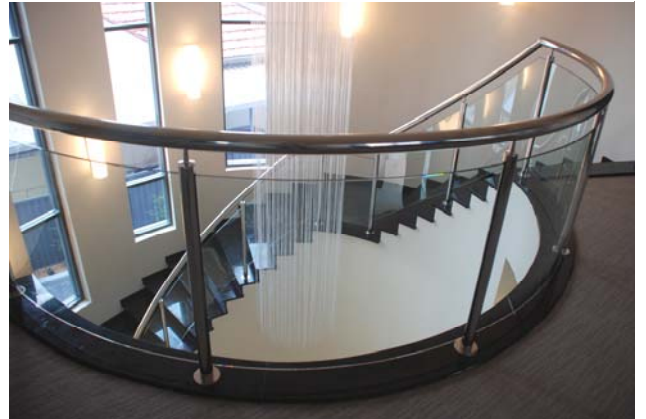
10mm clear toughened curved glass balustrade Private residence, Sandingham NSW