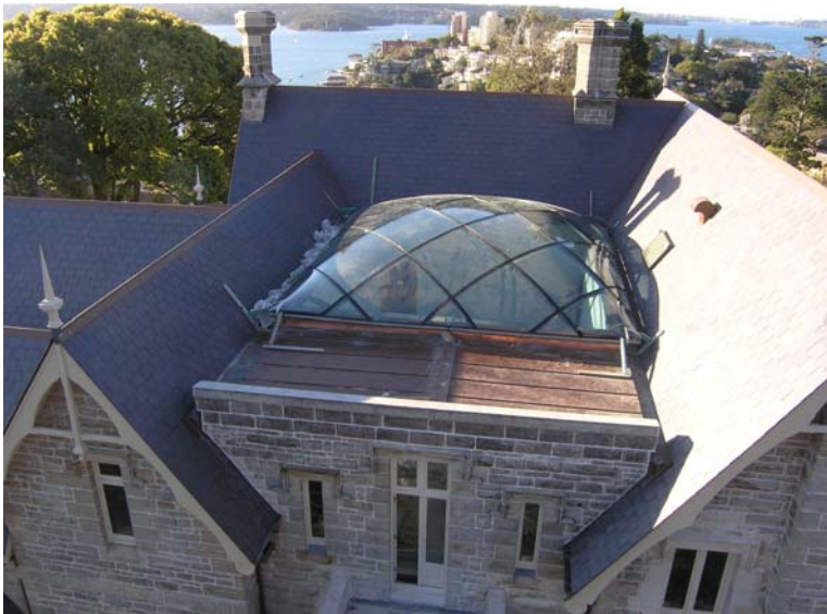
Double glazed units comprising 12mm clear annealed external layer with 12mm swiggle seal air space & 13mm 'low E' laminated internal layer Private residence, Bellevue Hill NSW