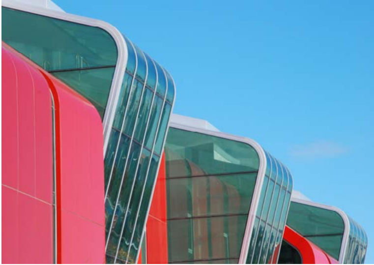
Curved double glazed units: External pane: 6mm Pilkington Evergreen eclipse advantage reflective coated Low E toughened curved glass—12mm swiggle seal air space. Internal pane: 13mm clear toughened laminated curved glass. Metropolitan Fire Brigade Building, Melbourne Victoria