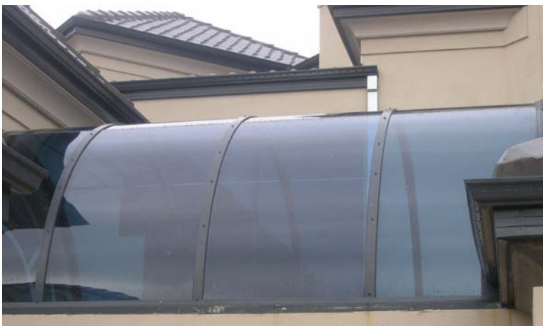
10mm blue tinted toughened curved glass barrel vault Private residence, Perth W.A.