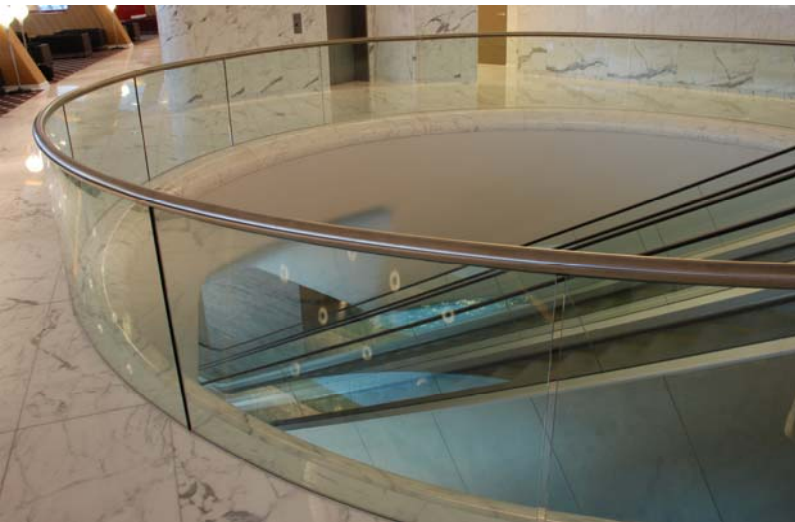
15mm clear toughened curved glass balustrade Qantas First Class Lounge, Mascot NSW