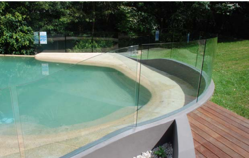
12mm clear shapecut toughened curved and flat glass pool fence. Non shrink grout fixing into rebate in concrete retaining wall. Seaforth Residence, NSW