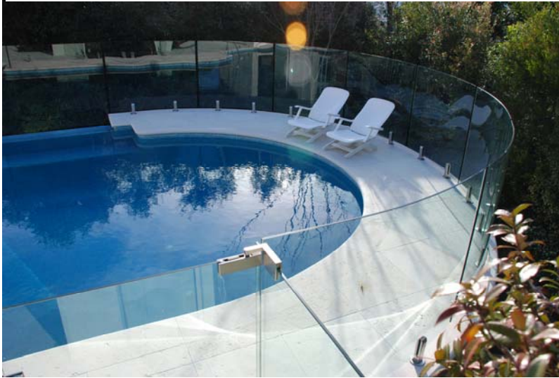
12mm clear toughened curved glass pool fence Private Residence, Bellevue Hill NSW